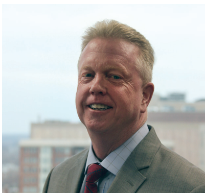
John J. Gallagher, Jr.